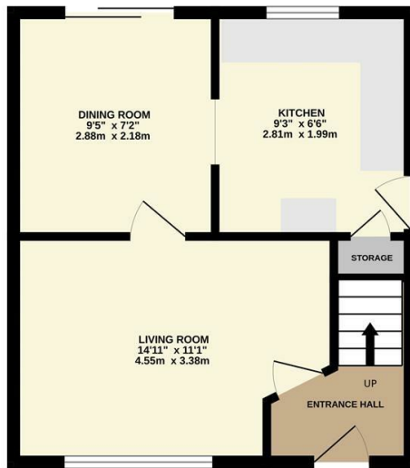
GROUND FLOOR 367 sq.ft. (34.1 sq.m.) approx.